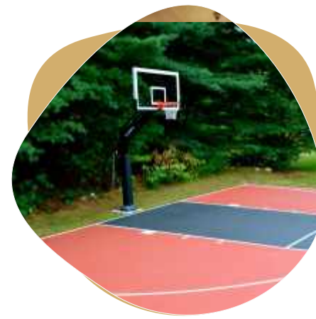
HALF BASKET BALL COURT

Lake Ridge Apartment offers countless options for leisure. Work out at the gym, host a party in the multi-purpose hall. And there are walking tracks for the fitness lover.