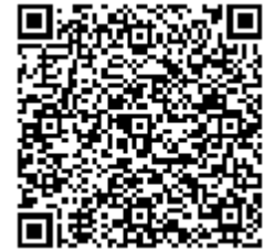
LOCATION QR CODE