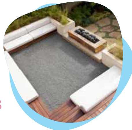
OUTDOOR SEATING DECKS

Lake Ridge Apartment offers countless options for leisure. Work out at the gym, host a party in the multi-purpose hall. And there are walking tracks for the fitness lover.